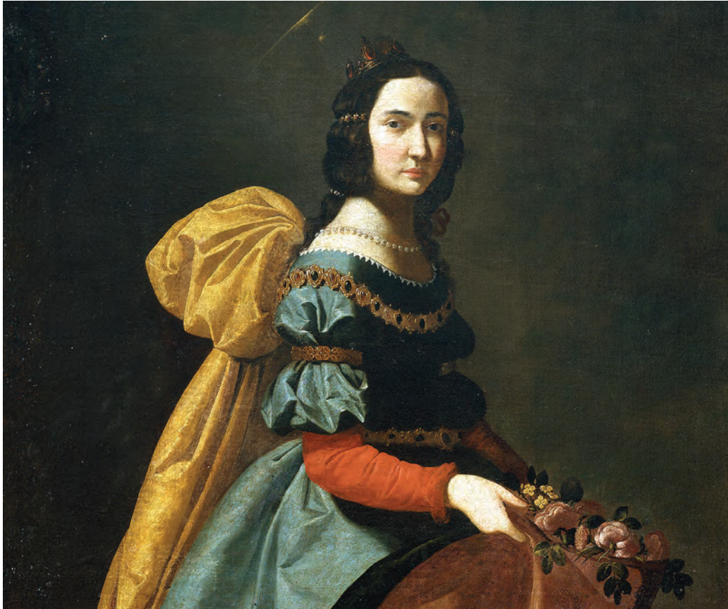
Francisco de Zubarán, Saint Elizabeth of Portugal (1635)

www.sjegoshen.org ~ Tel: 294-5328 ~ office@sjegoshen.org